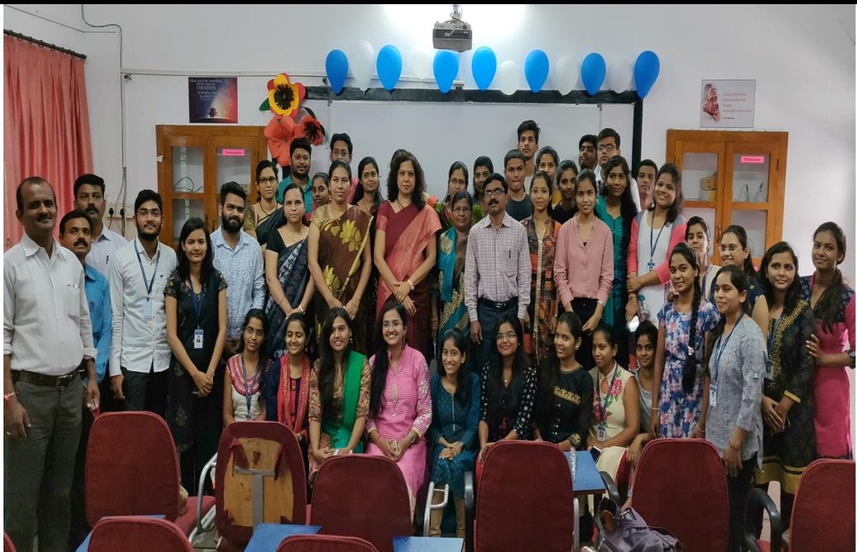
Teachers and students during the programme